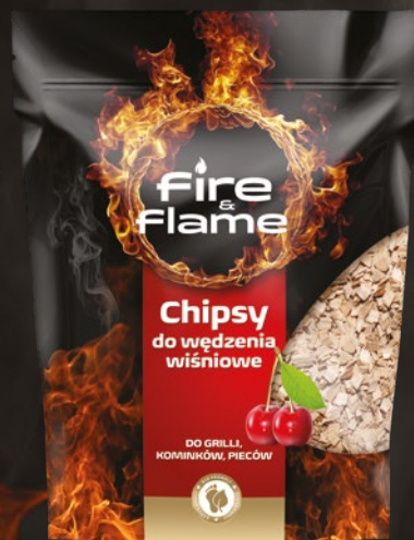
Cherry Smoking Chips