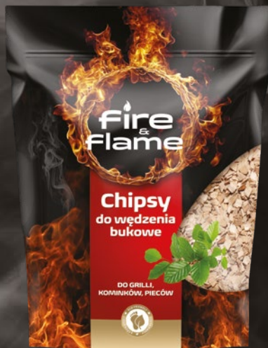
Beech Smoking Chips

Smoking chips is the latest solution for grilling, improving the taste and flavour of food. They are perfect for grilling and smoking of poultry, pork, fish, sausages, ribs and many other products. Depending on the type of wood used, they give unique aroma to the prepared dishes.