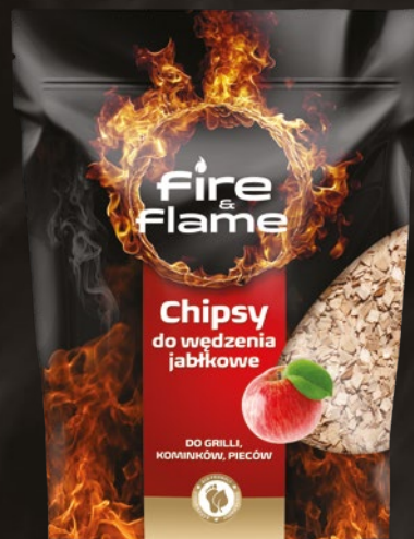
Apple Smoking Chips