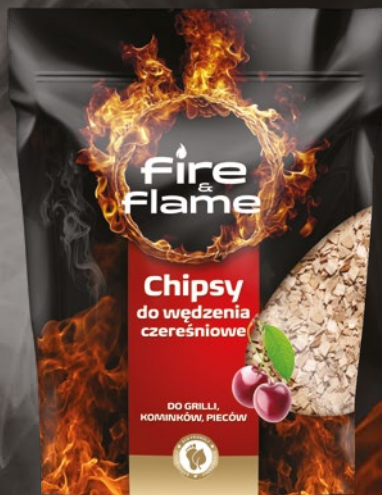
Sour cherry Smoking Chips